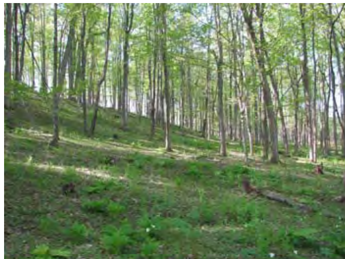
FIGURE 3.—A Cayuga County, NY, sugar maple forest shows a few surviving white trilliums in the foreground.