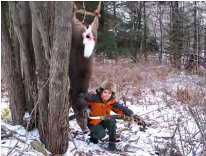
FIGURE 6.—Hunting remains an important tool in the management of white-tailed deer populations.

Landowners are encouraged to monitor deer impacts and, when necessary, to seek guidance from natural resource professionals who may be able to suggest remedial measures such as hunting, culling, fencing, repellents, scare devices, vegetation management options, or integrated combinations of these (Figure 6). Such measures may not eliminate deer damage, but reduce it to tolerable levels. Many sources of helpful information exist (e.g., Curtis and Sullivan 2001; Decker and others 2004; Ebersole 2006; Latham and others 2005; Pierce II and Wiggers 1997), but the problem remains large. Different regions and different sites within the same regions may face very different sets of challenging circumstances.