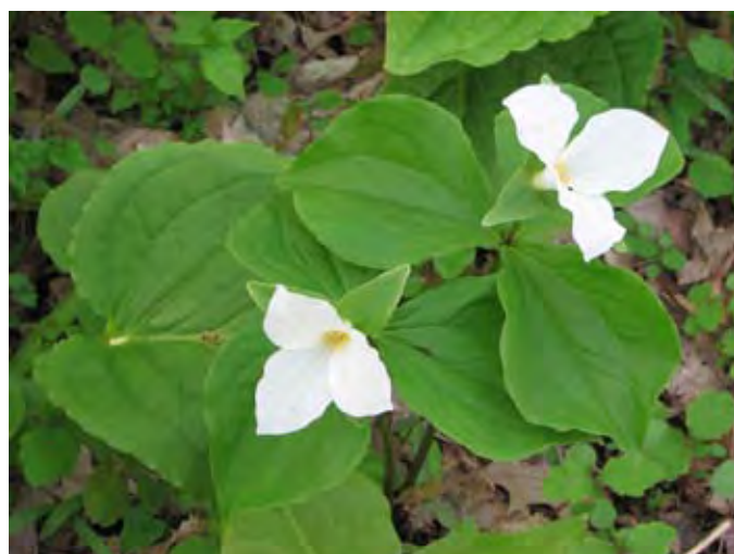
FIGURE 4.—White trillium, a native wildflower, can be decimated by deer (Rooney and Gross 2003).

White-tailed deer have been described as keystone species in forest ecosystems (McShea and Rappole 1992; Rooney 2001; Rooney and Waller 2003), implying that their feeding activity can directly and indirectly affect many other species. It has been said that deer are grazers by choice, browsers by necessity. During the spring and summer they feed primarily on herbaceous plants and the leaves of woody plants. In the fall, acorns and fallen fruits are favored. Browsing of woody stems is prevalent in winter, when other food sources are usually in short supply.