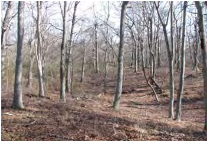
FIGURE 2.—This Suffolk County, NY, oak forest shows evidence of white-tailed deer overabundance.

What's wrong with this picture (Figure 2)?